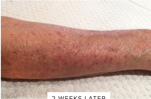
2 WEEKS LATER